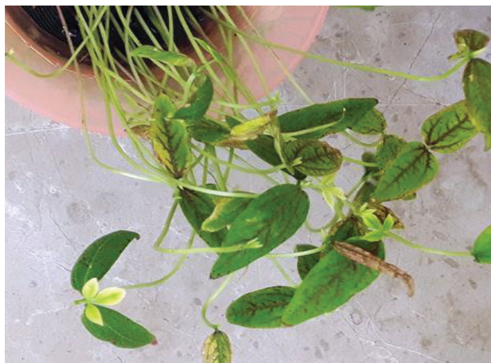
Fig. 5. Mn 7+ exposure, similar but mild impact