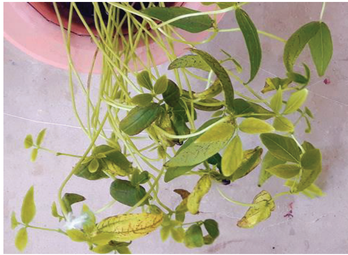
Fig. 4. Mn 2+ exposure, reduced chlorophyll