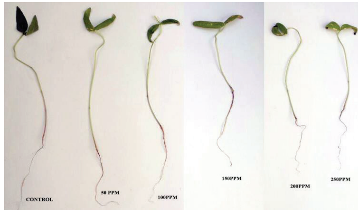
Fig. 3. Mildly reduced germination and growth under Mn 7+