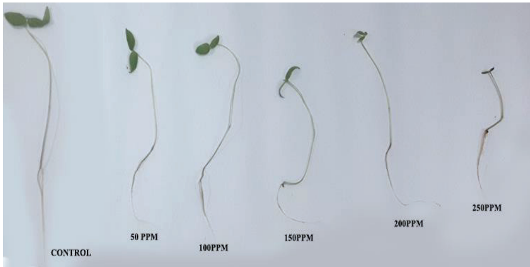
Fig. 2. Reduced germination and growth under Mn^{2+} exposure