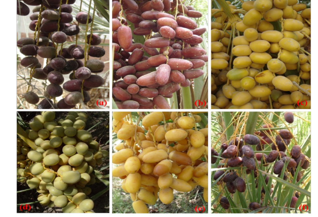
Fig. 9. Different exotic cultivars of date palm cultivated in district Khairpur, Pakistan: (a) Ajwa, (b) Safawi, (c) Ruthana, (d) Halini, (e) Begum Jangi, and (f) Shakri.

Date palm cultivar Medjool or in Arabic "majhul" which means unknown is a sweet and large in size (3-6 cm long and 2-3 cm in diameter), yellow colour at khalal stage and brown colour at tamar stage, cultivated originally in Tafilalt, Morocco. In addition, it is also grown in USA, Saudi Arabia, Israel, Jordan. Moisture content percentage of