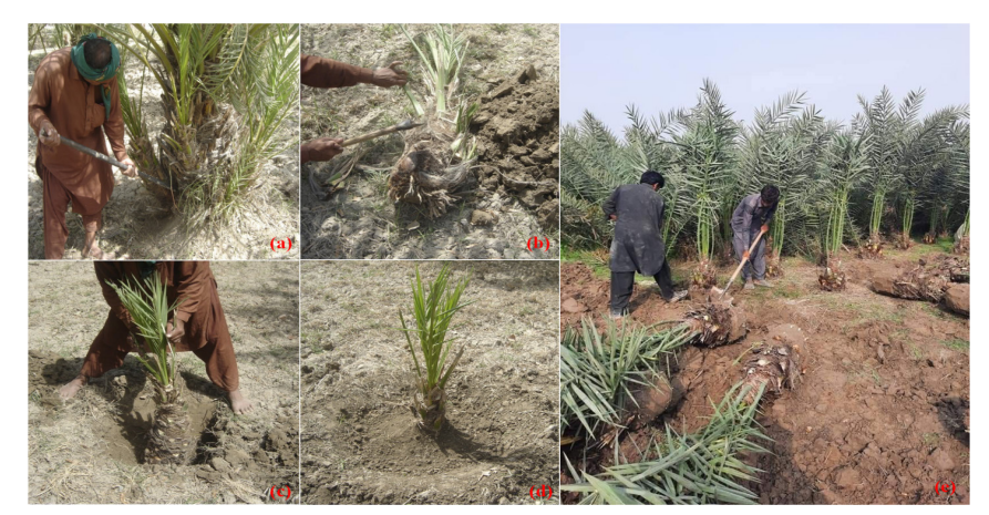
Fig. 6. Offshoot detachment from parent tree and cultivation in the field. (a) Removal of offshoot from parent tree, (b) Preparing offshoot for cultivation in the field, (c) Cultivating offshoot in the field, (d) Offshoot cultivated in the field, and (e) Well developed offshoots in nursery, shifting for cultivating in another field.

Numerous factors regarding offshoot selection (size and weight of an offshoot), upper or lower offshoots produced around a tree, origin, offshoot removal method, preparation for cultivation in the field, post-cultivation treatments to save from the disease and pests [52]. Offshoots are produced around each date palm tree during its early stage of growth in the field (Figure 6(a)). 2-3 years old offshoots (10-25 kg) with wider part of stem (0.5-1.0 feet) (Figure 6(b)), can be detached from the parent tree for cultivation in the field (Figure 6(c)), and in this way each newly cultivated offshoot produce 10-20 offshoots once established in the field. During detachment of offshoots, it should ensure first that tree should be free from any type of disease and pests. During detachment extra fronds of offshoots should be cut down from the base. Offshoots are removed using chisel made of iron which is used to cut down the side of offshoot attached to the parent tree (Figure 6(a)). Roots and base of offshoots should not be damaged during removal from the tree; because the offshoots with damaged roots will not survive in the field. Considerations related to offshoot selection and detachment include, cuttingoff the non-erect outer fronds and trim other fronds and ties them with a rope. Dipping or spraying the