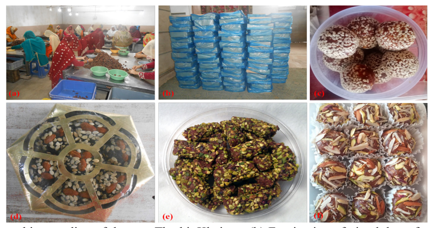
Fig. 4. (a) Women making grading of dates at Therhi, Khairpur (b) Fumigation of pitted dates for three days before export, (c) Dates paste balls with Sesame seeds, (d) Dates halwa with almonds, (e) Date bars with pistachio, and (f) Date paste balls with chopped almonds.