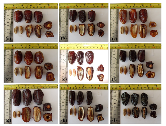
Fig. 5(a-i). Fruits of the different seed grown varieties of date palm obtained through selection cultivated in district Sukkur, Sindh, Pakistan.