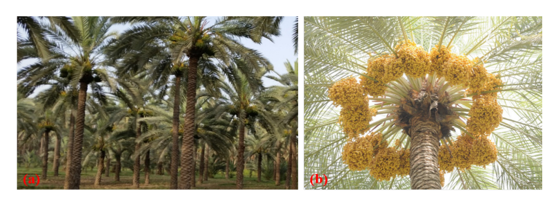
Fig. 1. (a) Date palm cultivation behavior in Sindh and (b) Date palm cultivar Aseel with fruit showing the number of bunches with dates at harvesting time.

Dates which can be consumed at khalal stage contain low tannins and high sugar concentration, and are not further processed to make tamar are