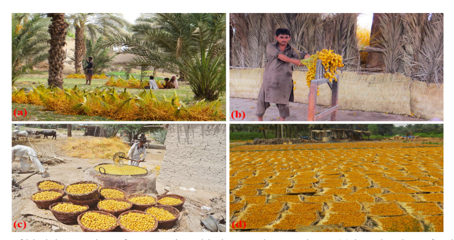
Fig. 2. Processing of khalal stage dates for preparing chhuhara and tamar dates. (a) bunches just after harvest, (b) fruit separation from bunches, (c) boiling of khalal dates for preparation of chhuhara, and (d) spread of boiled dates on mats for sun drying process.

classified as soft dates. Dates are consumed at different ripening stages except kimri, depending on the variety and chemical composition of dates [4]. Some date varieties known as soft contain low tannins and 50-85% moisture content are usually consumed at khalal stage such as Otakin, Dedhi, Kurh and Mithri grown in district Khairpur, Pakistan [33]. Soft dates contain high sugar content and are crispy and sweet in taste. Dates at khalal stage are harvested earlier during the season, and therefore, are a good source of income for the growers [38]. Dates with low tannins at khalal stage can be consumed, but soft type date varieties are rarely found in Pakistan. International commercial date varieties consumed at khalal stage are Zaghloul, Barhi, Hayany and Khalas. Barhi is sold in France, England and Australia; whereas, other three date varieties are mainly consumed locally [39].