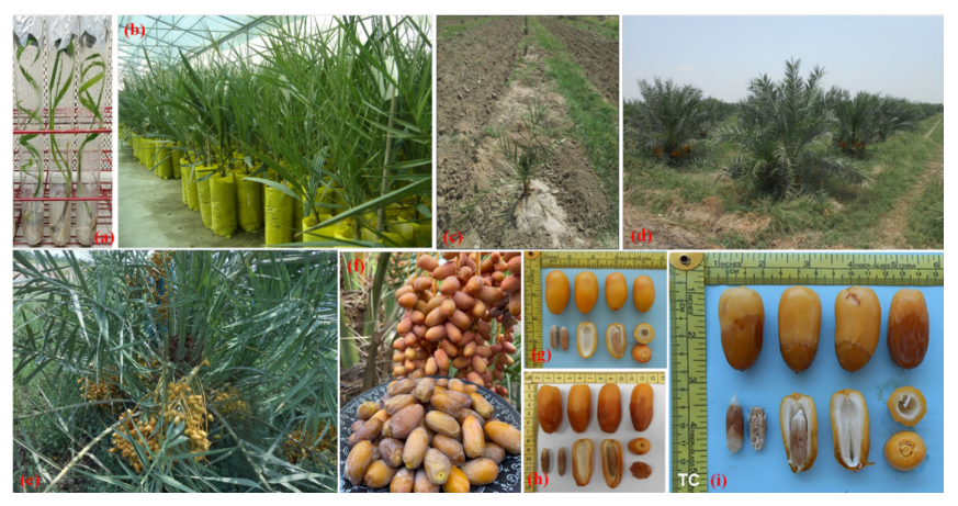
Fig. 7. (a) Tissue culture derived plantlets of date palm, (b) Micropropagated plants in the greenhouse ready for shifting in open field, (c) Tissue cultured plants growing in the field, (d) Tissue cultured plants at fruiting stage in the field, (e-f) Tissue culture obtained date palm cultivars Gulistan and Kashuwari respectively with fruits, (f, g, h, i) True-to-type fruits of date palm cultivars Samany (Egypt), Dedhi, Kashuwari and Gulistan respectively.

districts Khairpur and Sukkur, Pakistan. Tissue cultured cultivars include belong to soft type (Dedhi, Samany, Barhi), semi-dry (Kashuwari, Gulistan) and dry (Bertamoda) cultivars [44, 11]. More than 70 date palm growers cultivated tissue cultured plants of different varieties produced in Date Palm Research Institute which are currently ten years old and all the trees are bearing normal fruits (Figure 7(e-i)).