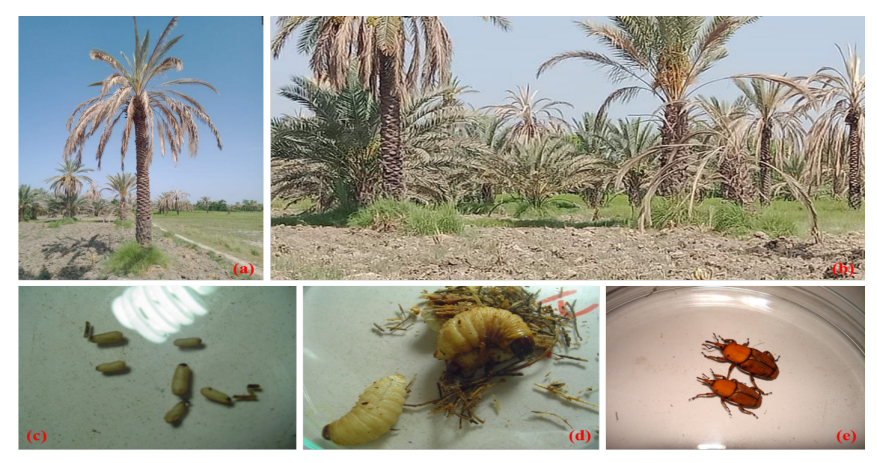
Fig. 11. Adult trees of date palm infected with Sudden Decline Disease after heavy rains (a-b). Different growth stages of Red Palm Weevil, (c) egg, (d) larva, and (e) adult.

This review study conclude that Pre- and Postharvest practices are still need to be improved in the area. There is no applicable method to save the trees from monsoon rain and only fruits of early date varieties harvested before onset of monsoon rains can be saved. Different date factories exporting dates to other countries rely on the quality of dates prepared by the farmers which need to be improved according to international standards. Selection of new varieties of date palm through seed propagation is difficult and time consuming. Field evaluation of exotic cultivars showed that soil and climate of district Khairpur are suitable for cultivation of commercially important date varieties. Micropropagation is an alternative way and is an applicable procedure to multiply elite and rare date varieties for the cultivation in the area. Elite cultivars of date palm (Dedhi, Kashuwari, Gulistan, Samany and Barhi) have