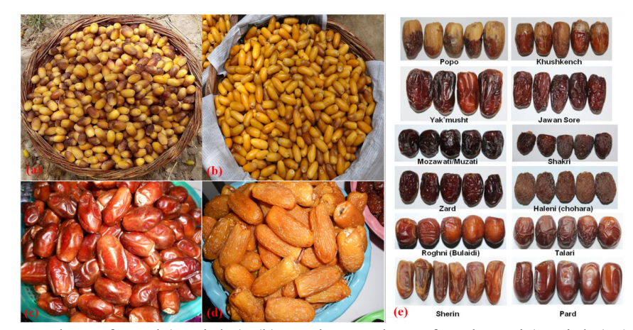
Fig. 3. (a) Rutab stage dates of Aseel (semi-dry), (b) Rutab stage dates of Kashuwari (semi-dry), (c) Tamar stage 'A' grade dates of Aseel consumed as table dates, (d) Yellow chhuhara of cv. Dhakki consumed locally as well as exported to India, and (e) Different date varieties grown in Balochistan, Pakistan which are consumed at tamar stage.

Dates consumed at rutab and tamar stages are classified as semi-dry dates. Rutab is the fourth stage of the fruit growth after khalal. Most semidry dates cannot be consumed at khalal stage due to high tannins such as Aseel, Kashuwari, Kupro etc. Rutab dates are a good source of income when sold as fresh, but in Pakistan poor storage conditions and packaging are big hindrances to obtain attractive prices. Aseel and Dhakki dates are mostly consumed in three forms (rutab, tamar and chhuhara) (Figure 3(a-d)) and date varieties grown in Balochistan, Pakistan are consumed as tamar (Figure 3(e)). Selected tamar dates of Aseel are consumed as table dates contain high amount of sugars and other food supplements required in daily diet. Dates are immediate source of energy,