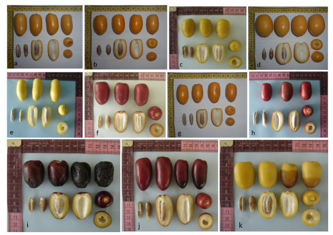
Fig. 8. (a) Aab-e-dandan, (b) Begum Jangi, (c) Gogna, (d) Halini, (e) Kooznabad, (f) Muzawati, (g) Pashna, (h) Shakri, (i) Ajwa, (j) Safawi, and (k) Ruthana.

eight cultivars of date palm belong to Balochistan, Pakistan are Aab-e-dandan (Figure 8(a)), Begum Jangi (Figure 8(b)), Gogna (Figure 8(c)), Halini (Figure 8(d)), Kooznabad (Figure 8(e)), Muzawati (Figure 8(f)), Pashna (Figure 8(g)) and Shakri (Figure 8(h)), and three cultivars of Saudi Arabia, i.e., Ajwa (Figure 8(i)), Safawi (Figure 8(j)) and Ruthana (Figure 8(k)). Offshoots of Saudi Arabian date palm cultivars were brought from Al-Madinah, Saudi Arabia in the year 2005, and planted in orchard [54]. Studies conducted on the tree and fruit evaluation confirmed that all three varieties of Saudi Arabia showed normal vegetative and fruit growth including number of bunches, bunch weight, fruit size, shape, weight and taste [4]. All fruit characteristics were similar to the fruits of parent trees as in Saudi Arabia.